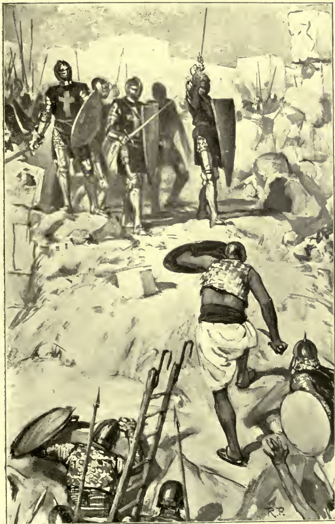
WITH WILD SHOUTS THE TURKS SWARMED UP THE RUINED MASONRY.